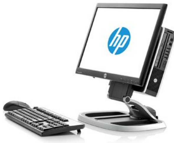
HP EliteDesk 800G1 Stand (Monitor Not Included)

Given the small size of the HP 800G1 Ultra Slim desktops, we're excited to also offer these unique monitor stands which allow you to hide the desktop behind your existing VESA mountable monitor. If your monitors do not support VESA mounts or you'd like to upgrade, we can get 21-24" LCD Monitors for $99-$139 depending on size and brand. These stands are available for $79 each .